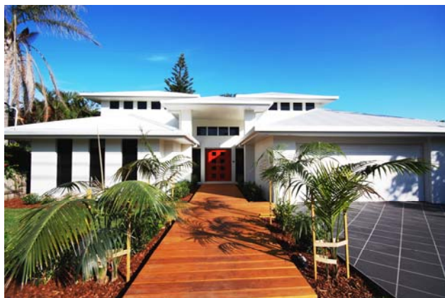
76 Chepana St. Lake Cathie

Then take the first left into Chepana St