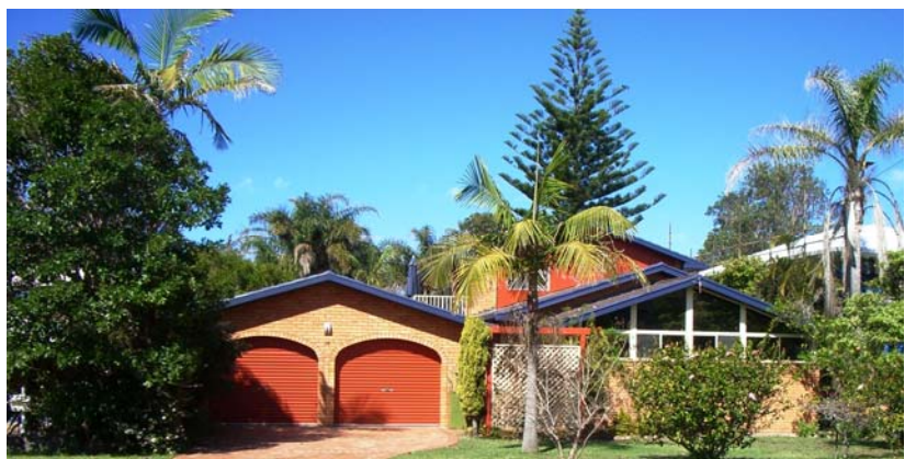
74 Chepana St. Lake Cathie

Then take the first left into Chepana St